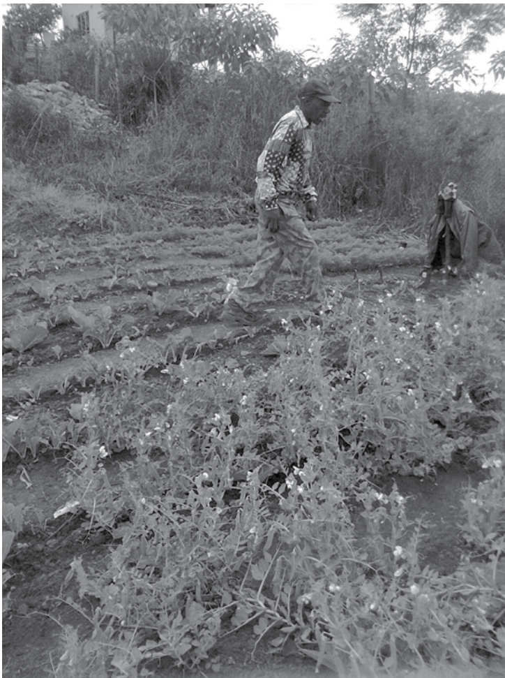
Community food gardens at Edendale Hospital

Overall, it was a successful workshop and we hope that, with these hospitals leading the way for sustainable environmental health practices in the province, communities can also learn and emulate these practices, thereby ensuring a healthy community. It is important that these hospitals continue to lay the foundation for improved public health and environmental sustainability so that this can be replicated by other hospitals and health systems in the country. ✕