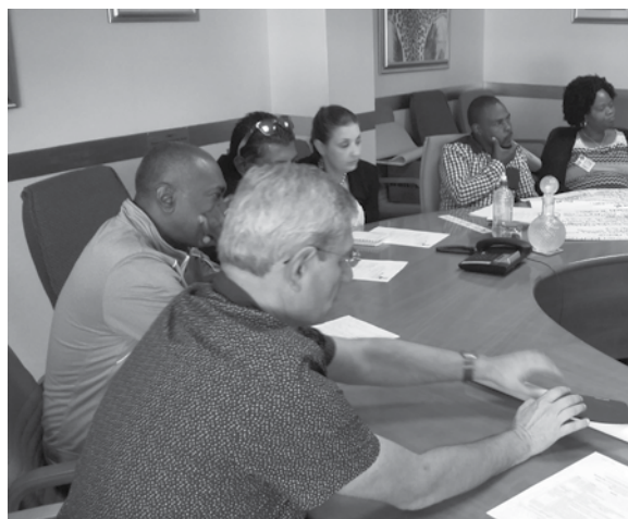
Workshop hosting the sustainability coordinators from six KZN hospitals.

To further support these hospitals groundWork, together with our global partner Health Care Without Harm (HCWH), organized a GGHH